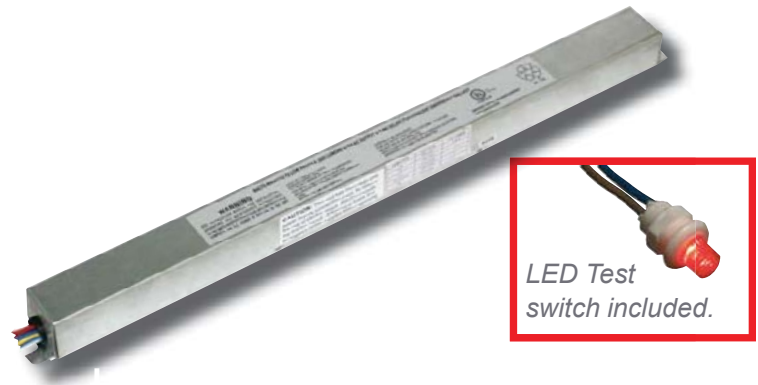
LED Test switch included.

1300 Lumen Low Profile Emergency T5 Fluorescent Ballast 120/277VAC