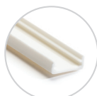
TALRT4MC 0295-1871 4' Plastic Mounting Channel Without A Lens For Mounting On Flat Surfaces.

APPLICATION AND PERFORMANCE SPECIFICATION IS SUBJECT TO CHANGE WITHOUT NOTIFICATION