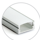
CSRTAL4SL 0369-3429 4' Aluminum Channel With Slim Milky Lens For Light Diffusion Of A Flat Surface.