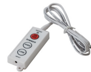
TRRPL-DIMMER INLINE DIMMER